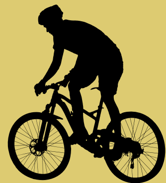
Cyclothon (timed) - 10K