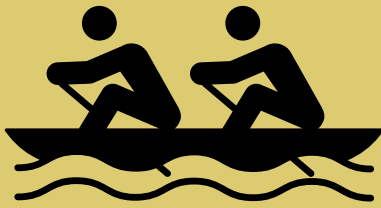
Indoor rowing 1000m ,750m,500m