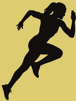
Athletics 100m | Athletics 4x100m