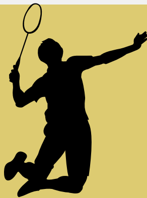
Badminton singles | Badminton doubles