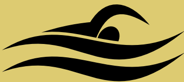
Swimming ( men and women)