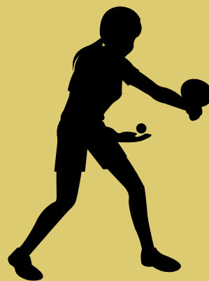
Table tennis singles | Table tennis doubles